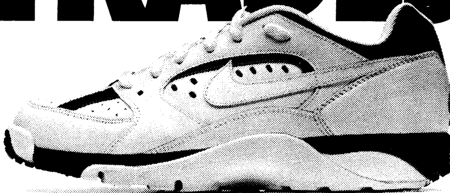
The Air Trainer Accel Low.